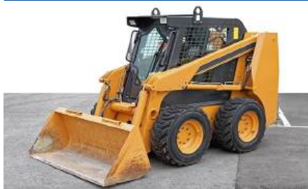
Combination-Loaders / Telehandlers